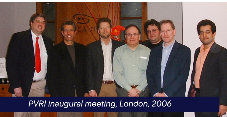
PVRI inaugural meeting, London, 2006

Founded in 2006, PVRI emerged from a shared recognition that addressing PH needed a more coordinated, international approach. At the time, understanding was limited, therapeutic options were scarce, and the voices of patients were too often absent from the global health agenda. PVRI was created to change this - by connecting clinicians, scientists, industry partners, and patient advocates across continents, and by building a framework for knowledge exchange that transcended borders.